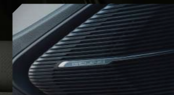
High Quality Speaker System